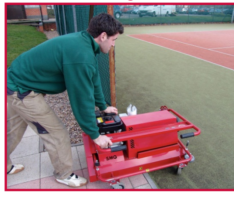
Hinged side broom on TurfSoft TS3

Ideal for use on surfaces with restricted access e.g. tennis courts