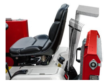
Shovel & rake

Technical Surfaces Limited Standards House Meridian East Meridian Business Park Leicester LE19 1WZ United Kingdom