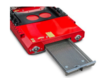
Adjustable stainless steel sieves